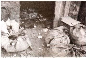
Girl imitating the photographer in Zebellin area, where Christians recycle the collected garbage.