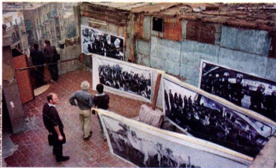
The rooftop was turned into a makeshift gallery.

By Aida Nassar The Daily Star Egypt staff