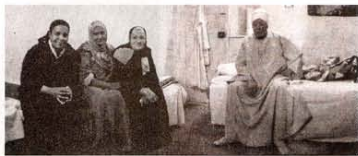
The people of Aswan living on rooftop of Downtown building.

Von Graffenried had held exhibitions on Sudan and Algeria. His photographs are held in several permanent museum collections. He published many books, among them: "Sudan, The Forgotten War" (1995), "Naked in Paradise" (1997) and "Inside Algeria" (1998).