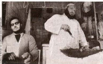
A bearded man sells meat on the market.