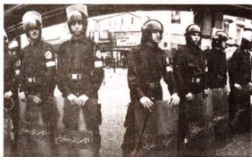
Riot police is closing access to Al Azhar Mosque on Friday, Feb. 9